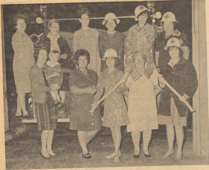
VOLUNTEER FIREMEN treated their wives to a Christmas party, then gave them a wild ride on the fire truck.